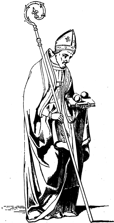
S. Nicholas ( Botticelli ).